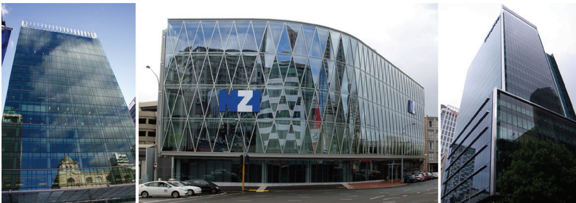
Fig. 2. Examples of recent ‘green’ rated buildings in Auckland, New Zealand

A review of a prominent ‘green’ rated building in New Zealand [20] stated that “Extensive and detailed modelling of the building facade was undertaken to determine a system that would provide the best balance of light transmission versus heat gain.” This particular building is almost 90% glazed with little solar protection and is fully air conditioned, thermally lightweight and is conspicuous by its artificial lighting that remains on for much of the day. According to the architectural science modelling methods described above (2.1) as well as the Lawrence Berkeley Laboratory report [12] and ASHRAE standards referred to [15], such a building envelope is inherently energy inefficient.